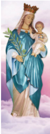
Our Lady, Queen of Peace, Pray for us

The Doors open at noon for adoration, confession, and exhibits.