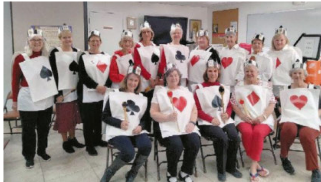
The "Card Marching" servers