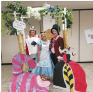
Guild Board Members