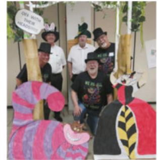
The Knights of Columbus Helpers